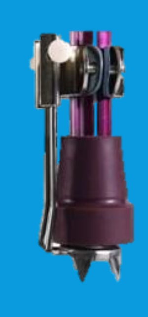
Ice grip cane attachment