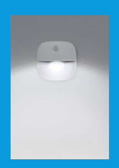
Motion activated lights

In the bedroom, the addition of some AT could be helpful to prevent falls, especially in the winter.