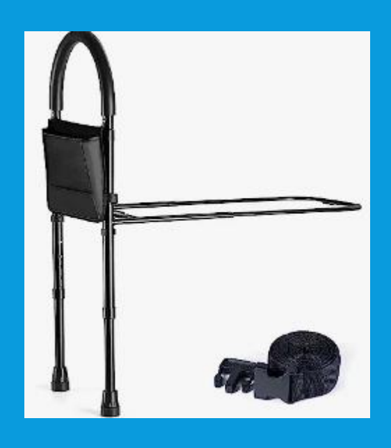
Bed assist rails