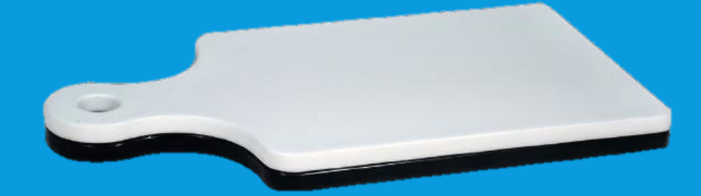
High contrast cutting boards