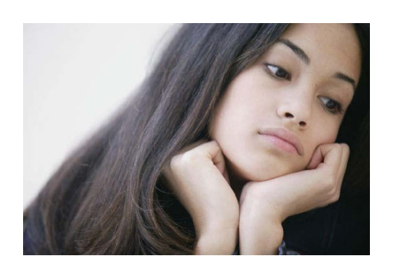
What some Missouri youth have to say...

"Despite the potential of clinical preventive services to improve adolescent health, research indicates that the delivery of these services lags well behind national recommendations. Barriers include financial constraints, with more than 15% of adolescents lacking health insurance; a lack of confidentiality or ambiguity regarding confidentiality, which may limit adolescents' disclosure of potentially crucial information; limited physician-patient interaction time; and a lack of confidence among clinicians in their ability to counsel on adolescent health risk behaviors."